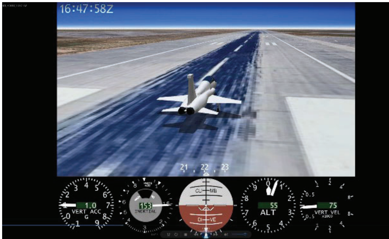
Figure 1: T-38A animation of suspected touchdown point (Tab Z-2)

The MLG touched down at approximately 153 knots and approximately 1,000 feet past the approach end of Runway 22L at 0848L (Tabs V-5.8, Z-2, and AA-6). In accordance with normal procedures, once the MP felt the MLG touch down the MP advanced the throttles to MIL and lowered the nose slightly (Tabs V-5.8 and BB-32). Following initial touchdown, when the MP perceived the MA had begun to climb, the MP raised the landing gear lever (Tab V-5.8 to V-5.9).