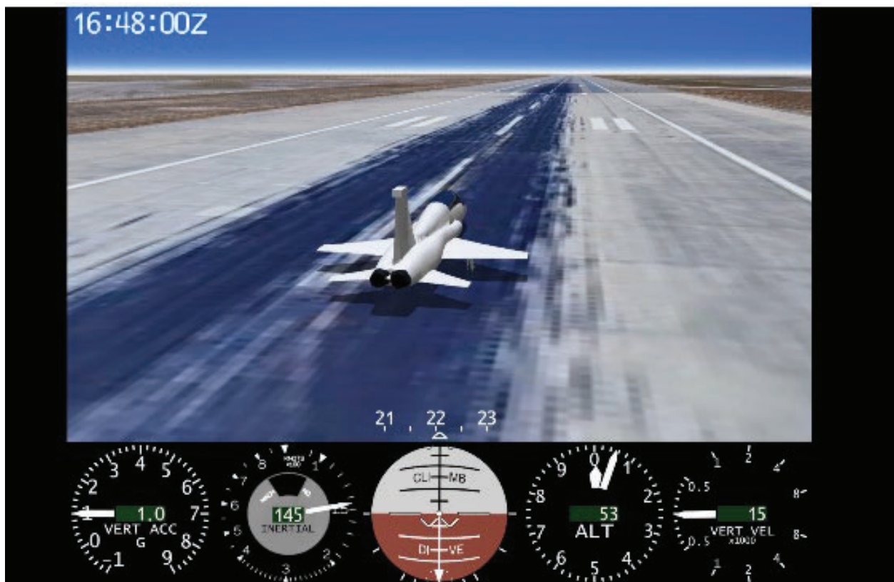
Figure 2: T-38A animation of touchdown +2 sec (Tab Z-3)

stop and immediately start extending again (Tab EE-10). The MP then perceived that the MA was flying away from the runway, at which point the MP put the landing gear lever back to the up position (Tab V-5.9). This stopped the extension sequence and immediately restarted the retraction sequence before the MP again perceived that the MA was descending to the runway (Tabs V-5.9 and EE-10). The MP then attempted to select MAX power (Tab V-5.9). The MIP recognized that the MP had placed the landing gear lever up, and observed the MP's additional cycling of the landing gear lever as the MA continued to sink toward the runway (Tab V-6.7). At some point during this sequence, the MIP put hands on the flight control stick and throttles in an attempt to maintain takeoff attitude while attempting to push the throttles forward (Tab V-6.7).