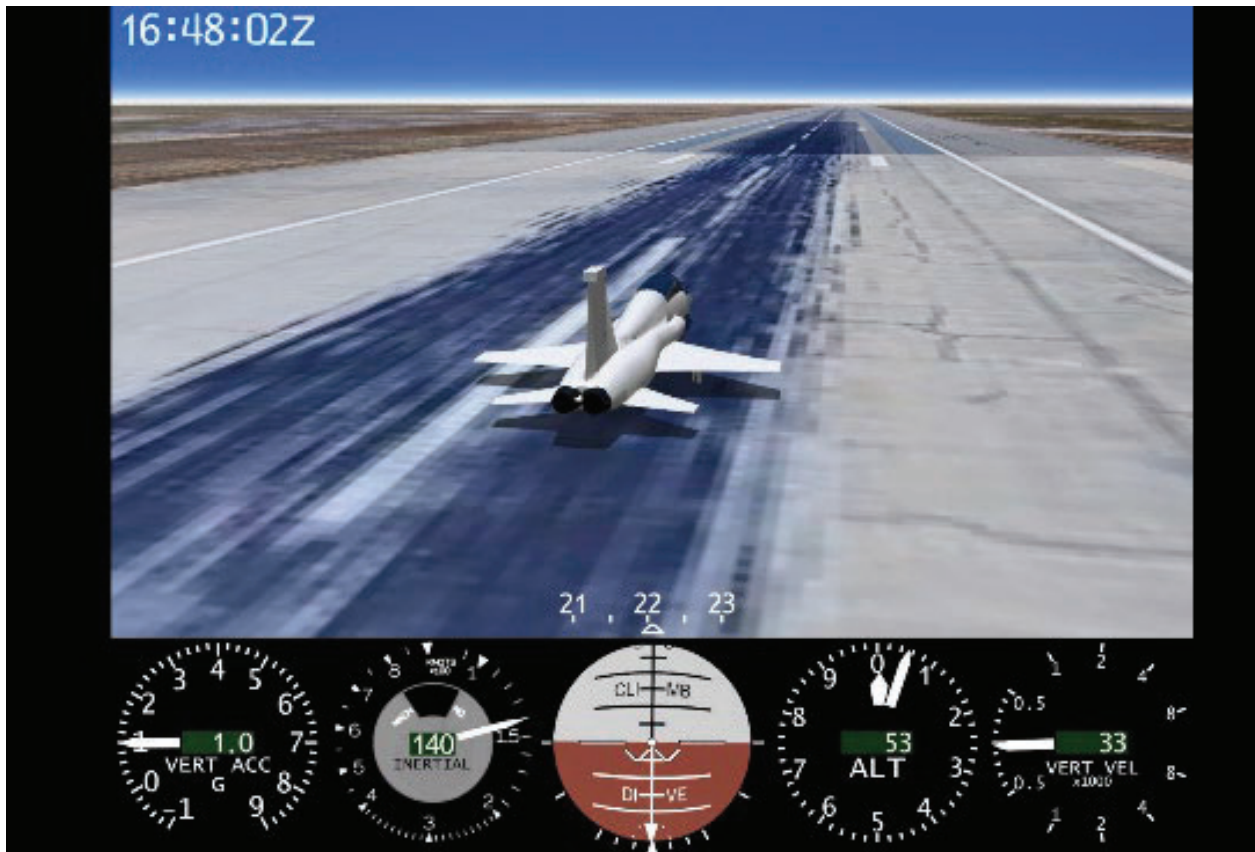
Figure 3: T-38A animation of ground impact of MLG doors and MLG (Tab Z-4)