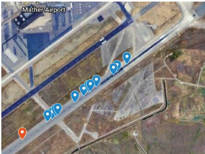
Figure 4: Mishap points of interest (Tab EE-20)