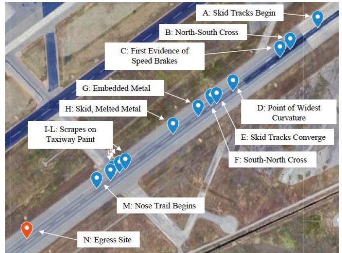
Figure 5: Details of points of interest (Tab EE-20)